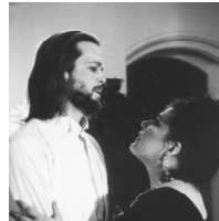
Les Contes d'Hoffmann, 2001